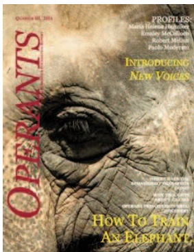
Quarter III, 2014 issue featured an archival photo on the back cover, which was taken in 1986 at Bad Kreuznach's Seminar. We asked our readers to help us identify people in the picture.