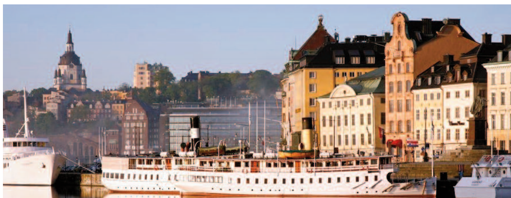
Gamla Stan, the Old Town, is one of the largest and best preserved medieval city centers in Europe, and one of the foremost attractions in Stockholm. This is where Stockholm was founded in 1252.

events, and their role in self-control. Iver Iversen presented the importance of basic research for successful application