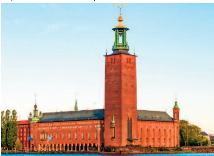
The City Hall is one of Stockholm's most iconic buildings. Built in 1923, it is home to the prestigious annual Nobel Banquets.

After a great conference in Lisbon two years ago, the European Association for Behavior Analysis (EABA) committee, in cooperation with the Swedish Association for Behavior Analysis (SWABA), arranged the bi-annual EABA conference in the beautiful city of Stockholm from September 10 to 13, 2014.