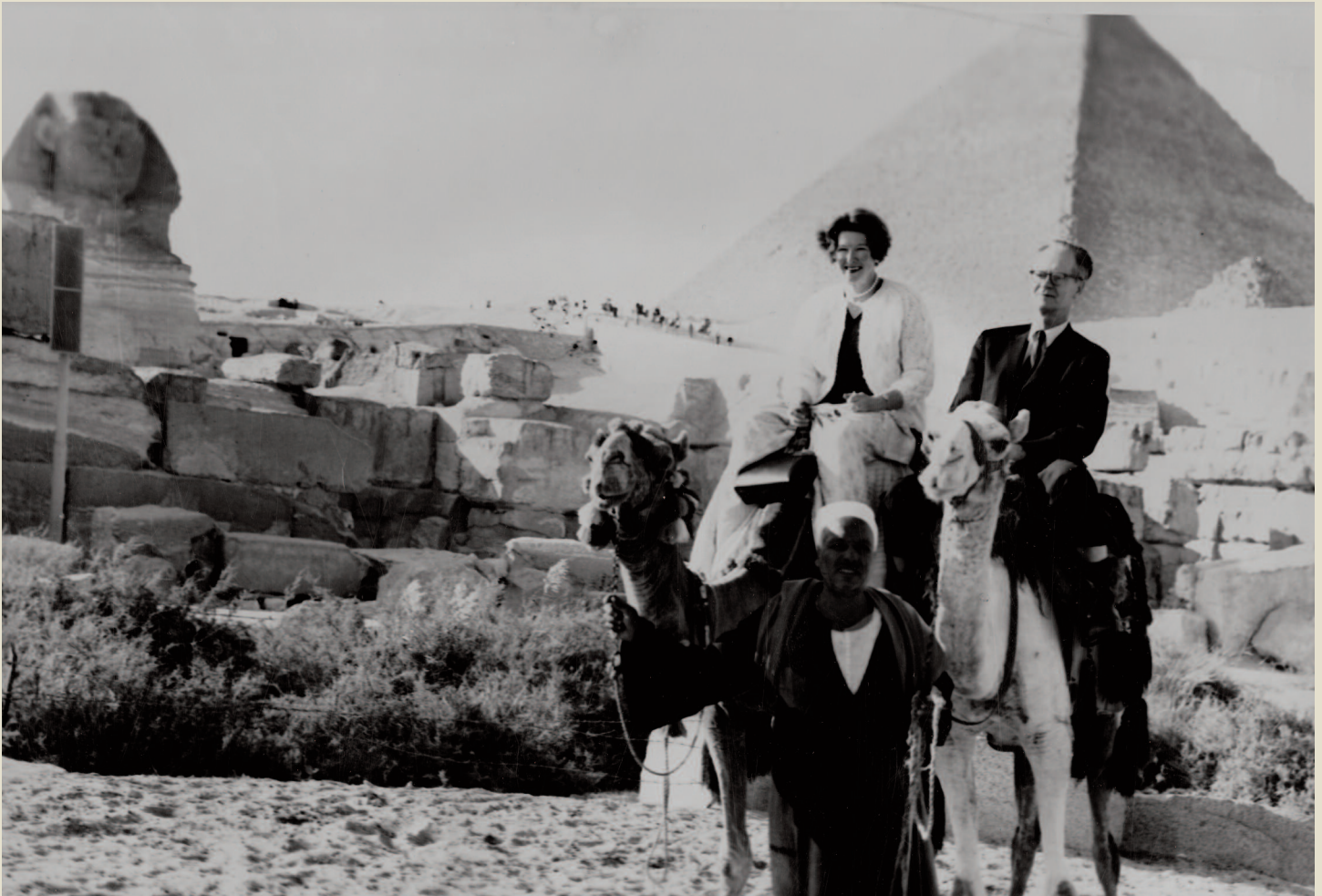
Continuing the international theme: Eve and B. F. Skinner riding camels in Egypt (February, 1964). It is not a paper cut-out. He actually wore suit and tie on this occasion!