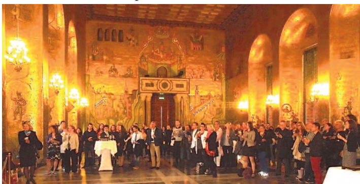
Opening reception in the City Hall of Stockholm.

The scientific part of the conference occurred at the